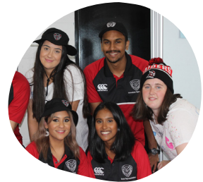
Senior Residents and Student Club return to Jane for training | Leaders Dinner | Registration Day | First Year Formal Dinner