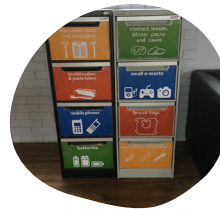
The Jane Ball! Socially distanced and dancing allowed! | The Environment Committee takes off | Mid-semester trip to the East Coast