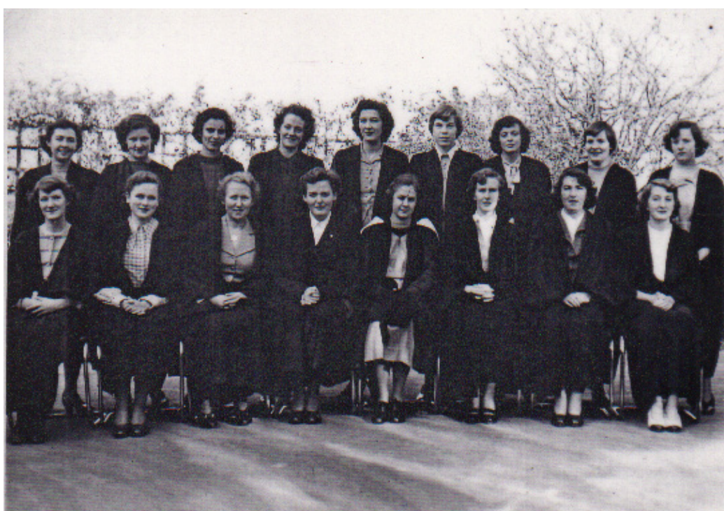
Left: The first-ever intake of students at Jane in 1950.

I made some very good friends at Jane, it was great. Mind you, I didn't see a lot of them except for weekends and then I played hockey on weekends. I had lectures from 9am till 6pm generally. Technically we had Wednesday afternoons off, but we didn't often get Wednesday afternoons off because there was a lot of work to be done. Particularly if you were prac subjects, which I was. I ended up doing Botany, Zoology and Geology in second year and they were all prac subjects which had excursions. And third year I majored in Zoology and Geology, and did