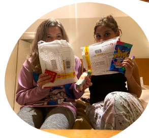
First interstate students arrive back in Hobart, doing ISO in hotels | Semester 2 starts