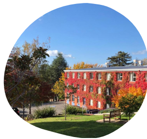
Jane enters its 70th year full of confidence and hope