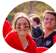
Jane Connected launches | Christmas in July lunch | Soccer and table tennis