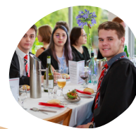
Welcome Weeks kick off | Returning students come back | Commencement: welcoming new students to Jane | Semester 1 begins