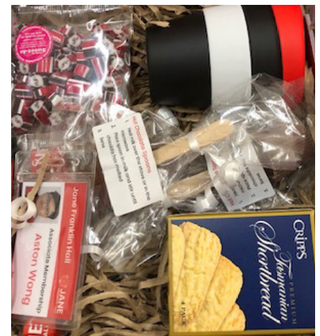
Above & Left: Associate Membership Welcome Boxes